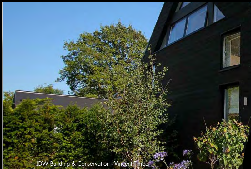
JDW Building &amp; Conservation - Vincent Timber